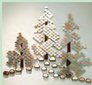
Giving Evergreen Memorial: Honor or memorialize someone special with a Pine Needle Cluster.