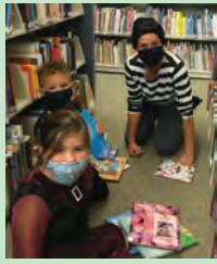
All family searches for books.