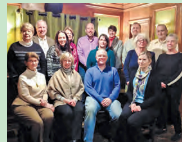
Library Board Members.