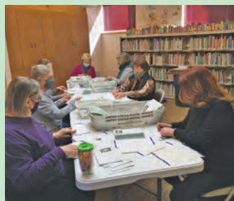
Friends Group at work on the Annual Appeal mailing.