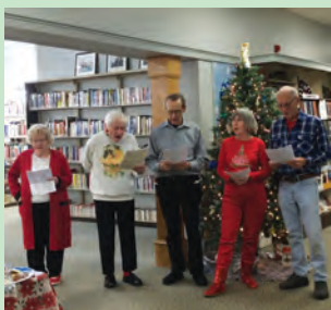
The Silvertones from the Dallas Active Senior Center performed at the Library Holiday Open House.

Children's Room information can be found on backmountainlibrary.org or on Facebook.