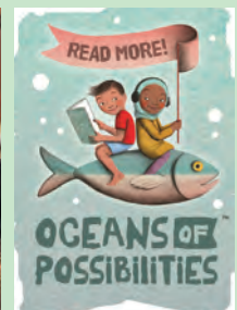
Oceans of Possibilities is the slogan for Summer Reading 2022.