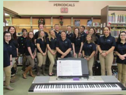
Dallas High School Chorus performed at the December library open house.