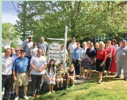
Dallas Lion's Club dedication of the new library sign.