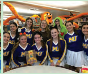
Misericordia U. Cheer Halloween Program