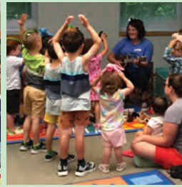
Music and Me