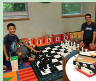
Summer Celebration Games