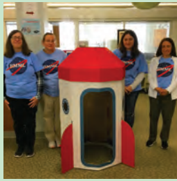
BMML Mission Control - Space Saturday