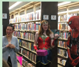
Summer Celebration Raffle Drawing