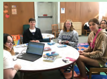
Wilkes University Day of Service