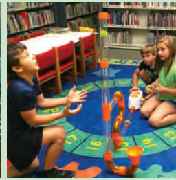
Group Summer Prize - Air Toobz