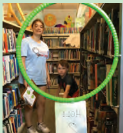
Paper Plane Golf

Children's Room information can be found on backmountainlibrary.org or on Facebook.