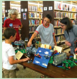
Community LEGO Display