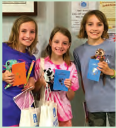
Adopt a Reading Buddy