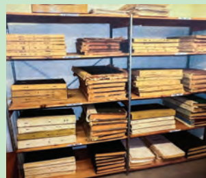
The Dallas Post archiving.