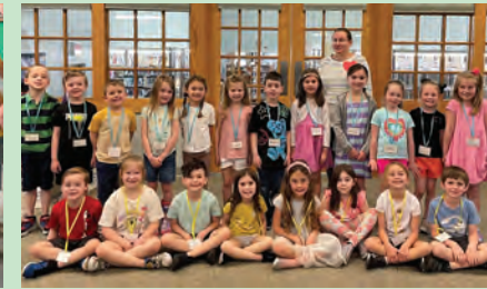
Building Blocks Learning Center campers on a book hunt.