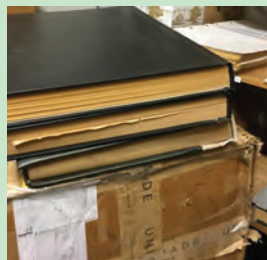
The Dallas Post before being digitized.