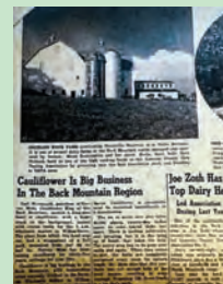
The Dallas Post archive example.